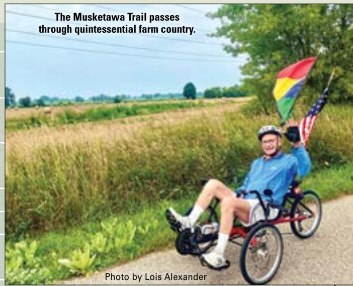
The Musketawa Trail passes through quintessential farm country.