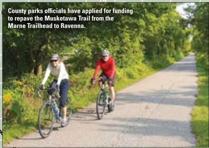
County parks officials have applied for funding to repave the Musketawa Trail from the Marne Trailhead to Ravenna.